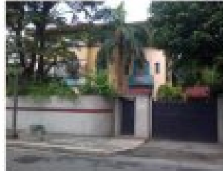
entry gate to the subject property