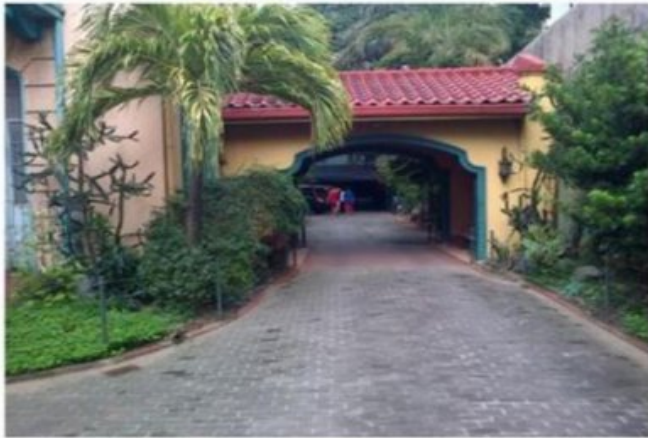
driveway leading to garage and servants' quarters